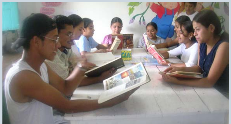
Students of a similar age meet in book groups.

Did you know that CDA now sponsors 84 girls and 12 college students in their studies? WOW!