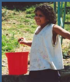
Tree planting took many hands, but there were many hands lent.