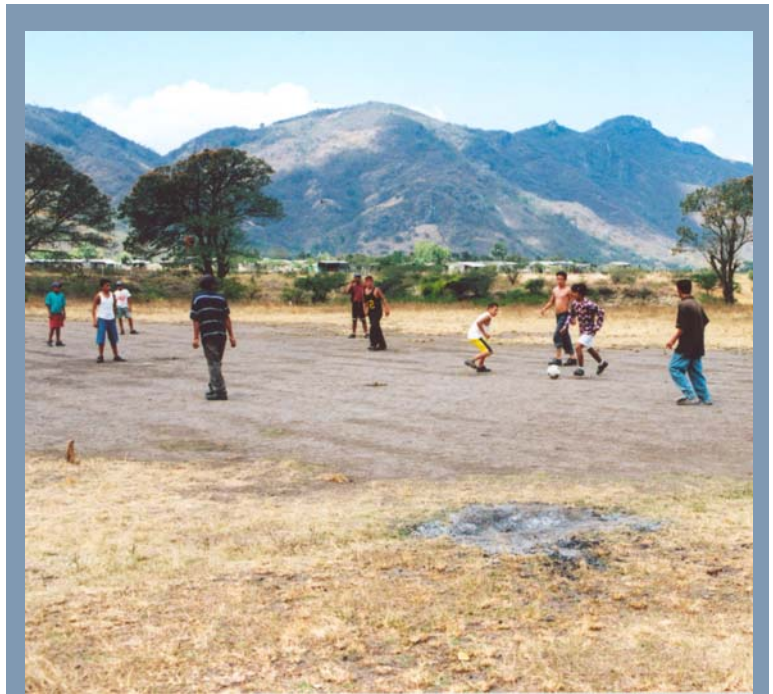
This field was cleared and three new streets laid out during our visit, depriving the neighborhood youth of one of the few places of recreation. We felt strongly that a place to play is important for the young people and helps keep them busy.